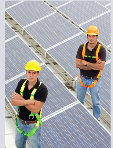
Solar Flow-Through's developers manage all aspects of engineering, procurement and construction of solar projects.

The 2016 LP raised $14,881,000 in 2016. The 2016 LP has a targeted income distribution of 7% per annum. Management expects income distributions to commence by the end of 2018.