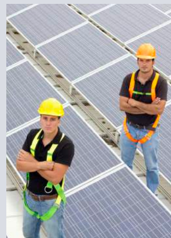
Solar Flow-Through's developers manage all aspects of engineering, procurement and construction of solar projects.

In May 2016, Solar Flow-Through announced an offering, on a private placement basis to accredited investors only, for the Solar Flow-Through 2016-I Limited Partnership.