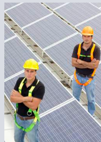
Solar Flow-Through's developers manage all aspects of engineering, procurement and construction of solar projects.

A total of $10.036 million, representing 92.5% of the 2017-I proceeds, is to be incurred on Canadian Renewable and Conservation Expenses. The remaining proceeds are to be incurred on fully deductible partnership expenses in 2018. The 2017-I LP renounced $10.036 million in CRCE at year-end 2017. The CRCE Proceeds will be incurred for the continued development of FIT 5 projects.