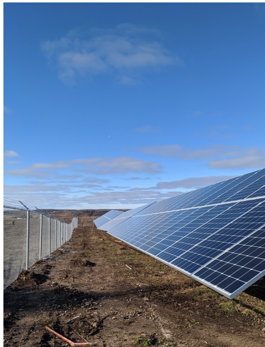
Project MS O5, a 600kW AC project completed in November 2020.

In response to the COVID-19 pandemic, Solar Flow-Through Funds (the “Company”) took precautionary measures to ensure the health and well-being of our employees and to minimize any potential risk of business disruption. The Company responded quickly to the global COVID-19 pandemic by introducing policies and procedures tailored to the outbreak that restricted non-essential business travel and implemented World Health Organization recommendations for slowing the transmission of COVID-19 in the workplace. While the Company maintains a comprehensive business continuity plan, it is our belief that the focused actions we have taken to address COVID-19 will serve both to protect the well-being and safety of our employees and mitigate any potential business or operational disruption.